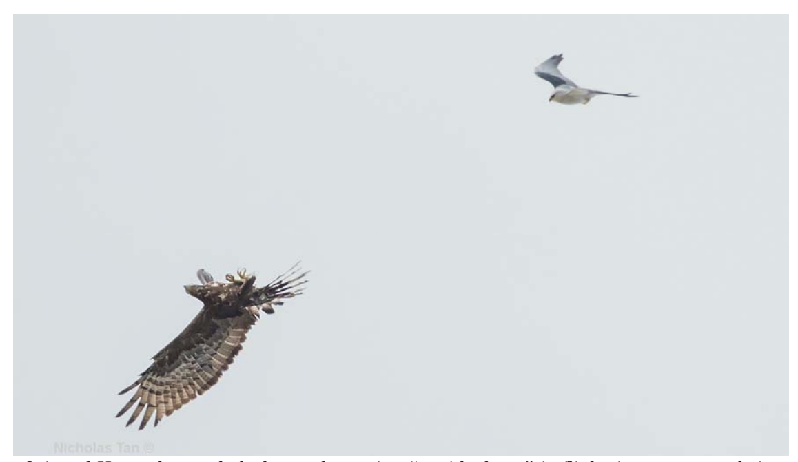
Oriental Honey-buzzard, dark morph, turning "upside down" in flight, in response to being mobbed by a Black-winged Kite, at Tanah Merah, 201012, by Nicholas Tan.

As always, the Brahminy Kite , White-bellied Sea Eagle and Changeable Hawk-eagle were also recorded.